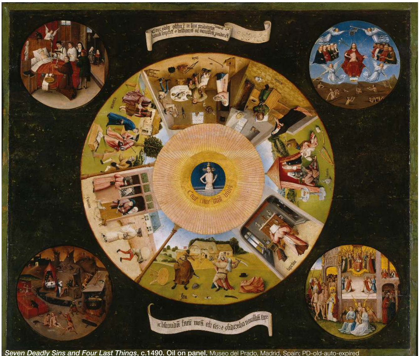
Seven Deadly Sins and Four Last Things, c.1490. Oil on panel. Museo del Prado, Madrid, Spain

The central figure is a plump, ostentatiously dressed figure restrained in a chair with a bulging money bag at his side presumably for payment undergoing a surgical procedure to remove stones from an incision in his head. Thanks to the ornate gothic script surrounding the picture, we know his identity as he pleads in Dutch, "Master, cut the stone out quickly My name is Lubbert Das." Lubbert Das was a folk figure personifying the ignorant fool or lubber, but historians have also speculated that his name may be translated from Dutch as "castrated dachshund" or "geldered badger," considered by some to imply a cuckold, a subject of ridicule in that era, having either delusions of infidelity or being cheated on and sent by his wife to be cured. 2,16 His bulbous genitalia or codpiece lend credence to this sarcastic interpretation.