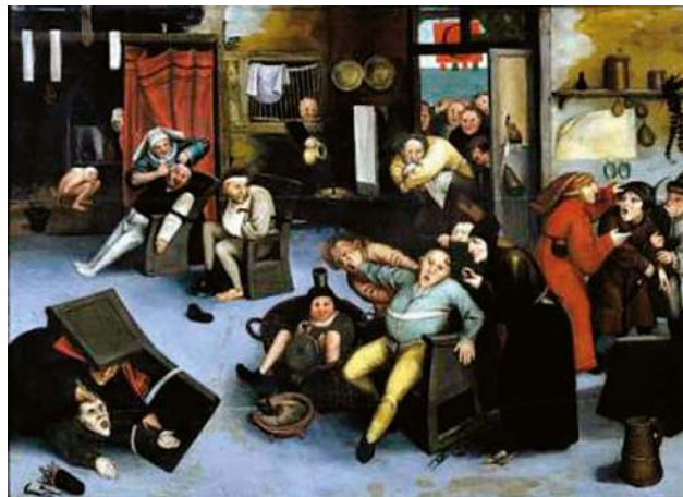
Cutting Out the Stone of Madness, Bruegel, c. 1550. Copy of a missing original. Musee d l'Hotel Sandelin, Saint-Omer, France; PD-old-auto-expired

Regardless of whether this procedure occurred in historical reality as a clinical intervention or as deliberate quackery, Bosch's larger statement is that the belief that madness or folly comes from a stone and could be cured, or that wisdom and knowledge could be gained by