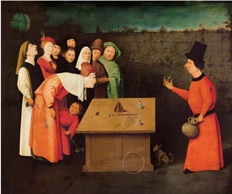
The Conjurer, c. 1496 or later. Oil on Panel. Municipal Museum, St-Germain-en-Laye, France; PD-old-auto-expired

The artist's message is also revealed by his portrayal of the operative team; a surgeon with a uroscopy flask at his side, a common tool for the better known procedure of cutting for urinary stones, and an upturned funnel on his head like a dunce cap which suggests science turned upside down. The funnel was a valued tool and symbol from the laboratory of alchemists, a respected and serious scientific discipline.