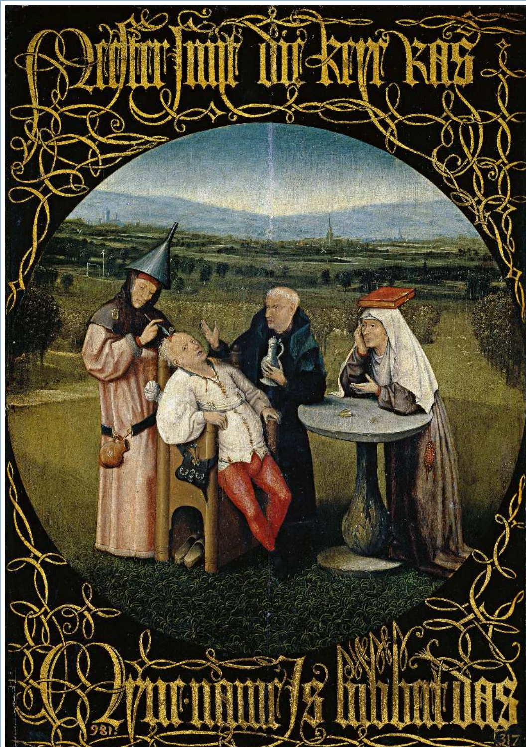
The Cure of Folly , c. 1488. Oil on panel. Museo del Prado, Madrid, Spain; PD-old-auto-expired

A re-interpretation based on the life and times of Hieronymus Bosch