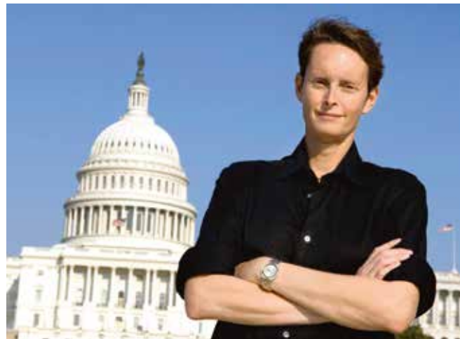
Activist Riki Wilchins.

Activist Riki Wilchins wrote "[transgender people] could portray ourselves in media as patients suffering from a medical disorder, or as an oppressed minority demanding their political and civil rights, but it was very difficult to do both simultaneously." 12 In 1995, a transgender rights group picketed the national meeting of the American Psychiatric Association, protesting the new DSM-4 classification of gender identity disorder for the same reason. 12 While homosexuality as a psychiatric diagnosis was removed from the DSM in 1973, it would take decades