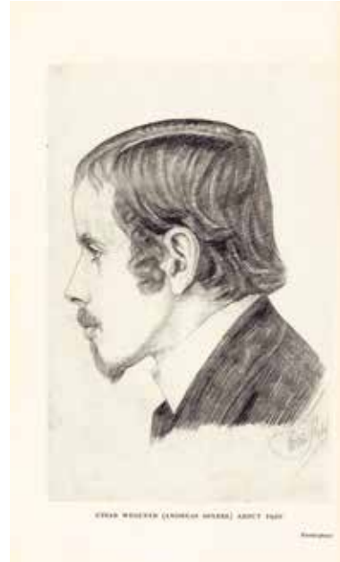
From the book Man into woman: An authentic record of a change of sex, by Lili Elbe, 1933.

In the final years of its existence, the Institute served as a launching pad for the development of several groundbreaking surgeries related to sex reassignment. It was here that Lili Elbe was treated by Hirschfeld and Warnekros in 1929.