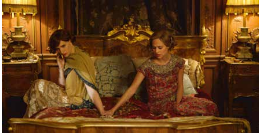
From left, Eddie Redmayne and Alicia Vikander in The Danish Girl.