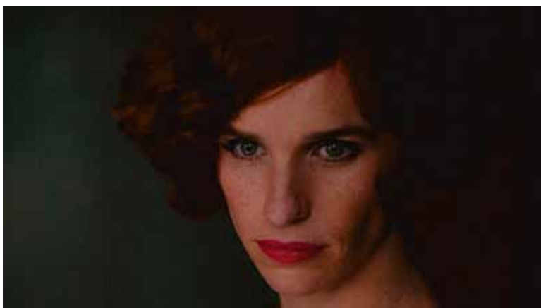
Eddie Redmayne portrays Lili Elbe in The Danish Girl .

it is based, illuminates one of the most significant moments in the history of transgender medicine. Elbe represents the culmination of decades of research on the development of the “medicalized sex change,” which redefined the relationship between physicians and transgender individuals. 4 Doctors in Elbe’s lifetime, as depicted in film and writing, represent conflicting approaches to transgender health that shaped medical thinking and health care policy throughout the 20th century, with relevance to the present day.