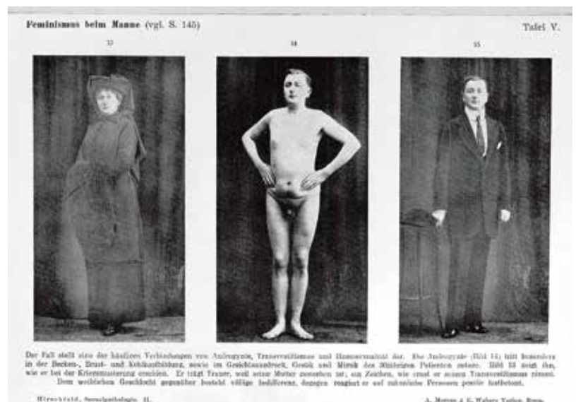
A page from Magnus Hirschfeld’s 1947 book Sexual Pathology: A Study of Derangements of the Sexual Instinct.

An alternative, gender-affirming practice began to rise concurrently with these attitudes. In the first half of the 20th century, sexologist Magnus Hirschfeld became one of the first scientists to recognize homosexuality and cross-gender identification as distinct, developing the separate classification of “eonism” to describe cross-gender