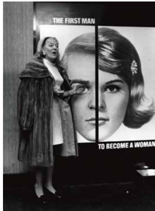
Soldier and actress Christine Jorgensen publicly transformed from male to female in 1952.

With frequent reports of sex reassignment surgeries emerging in the media, physicians began to openly discuss