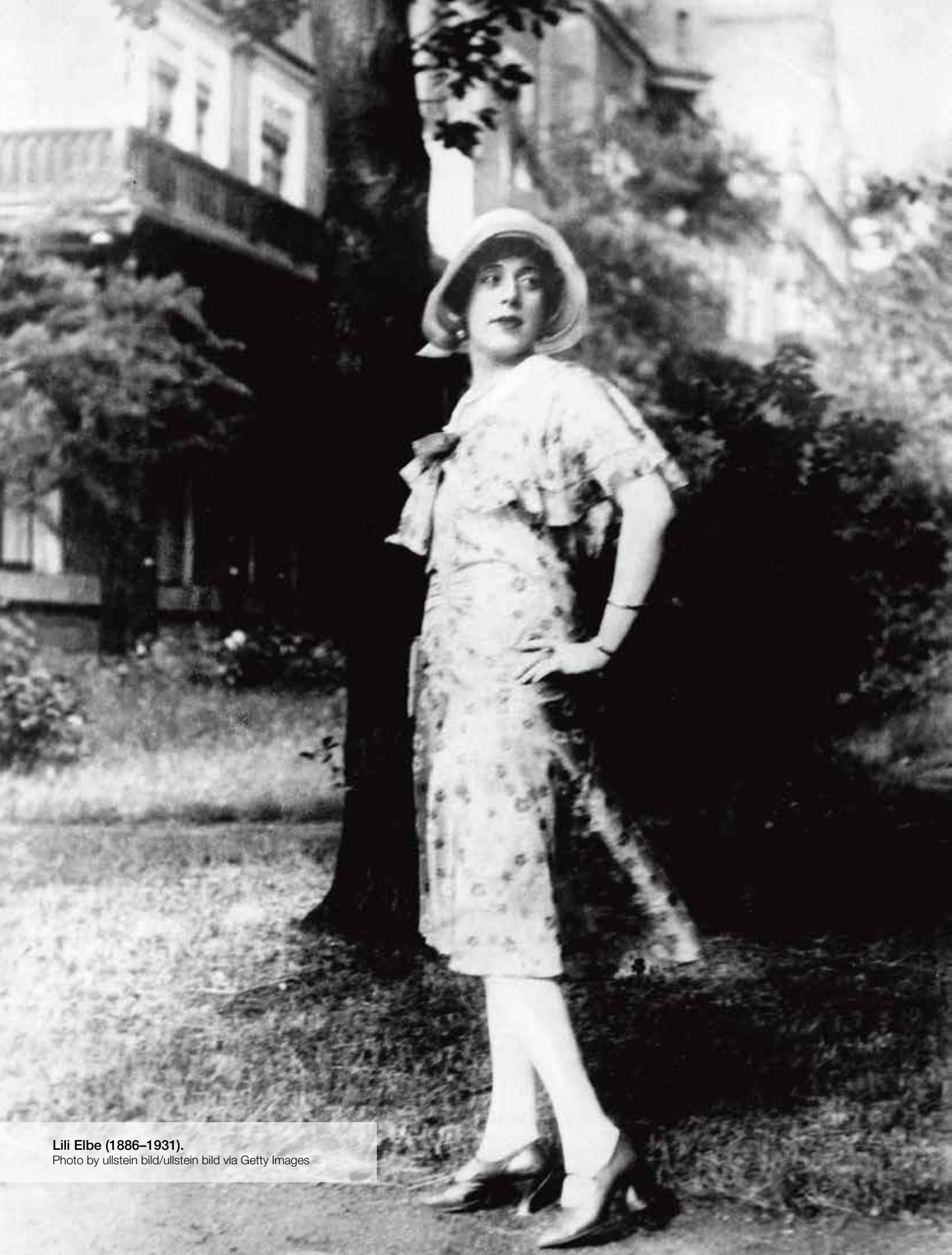
Lili Elbe (1886–1931).