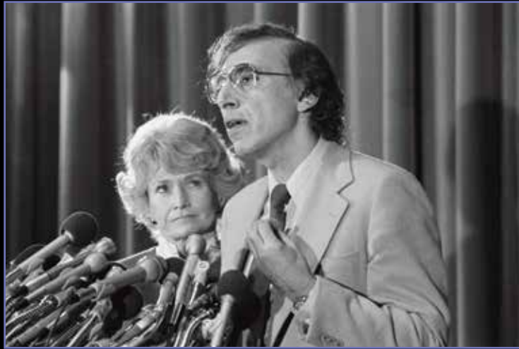
Dr. Robert Gallo and Secretary Margaret Heckler hold a press conference concerning the cause of AIDS, April 23, 1984.