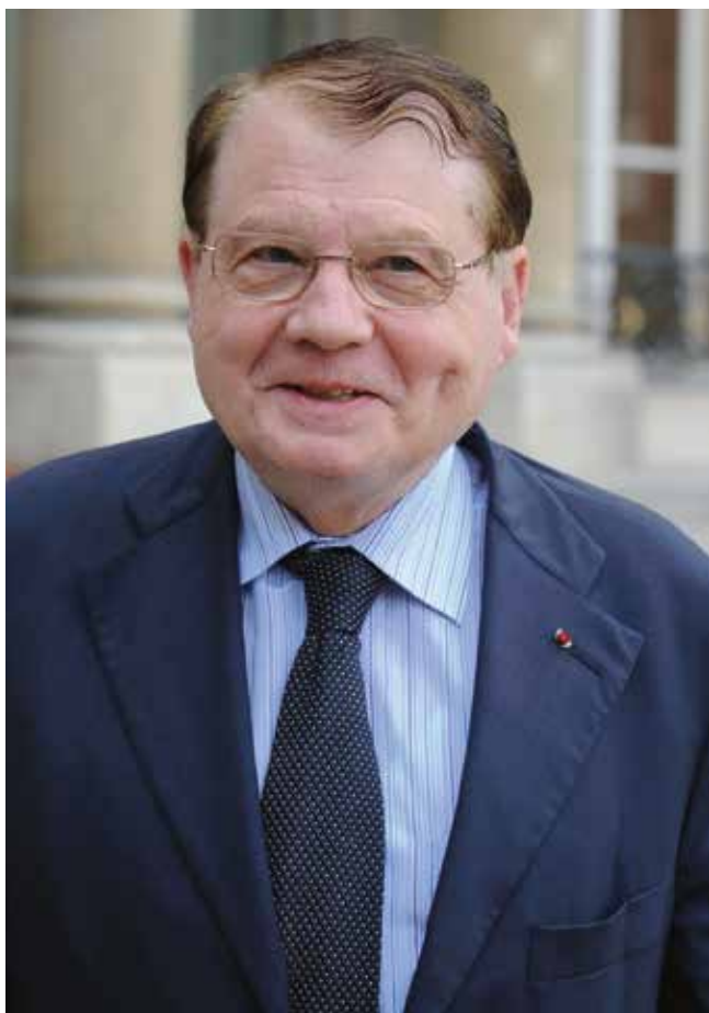
French scientist Luc Montagnier poses in the courtyard of the Elysee Palace after a meeting with French President Nicolas Sarkozy, October 8, 2008, Paris.

the screening ELISA test, or confirmed as positive by another test such as a Western blot.