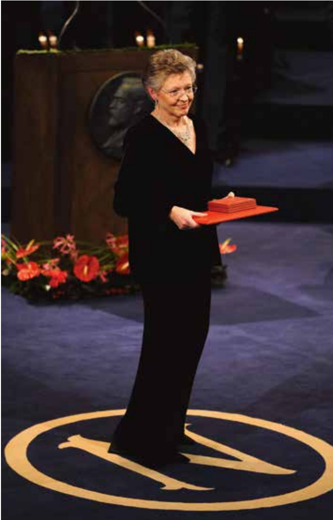
French scientist Françoise Barre-Sinoussi receives the 2008 Nobel Prize for Medicine for her discovery of the virus that causes AIDS.