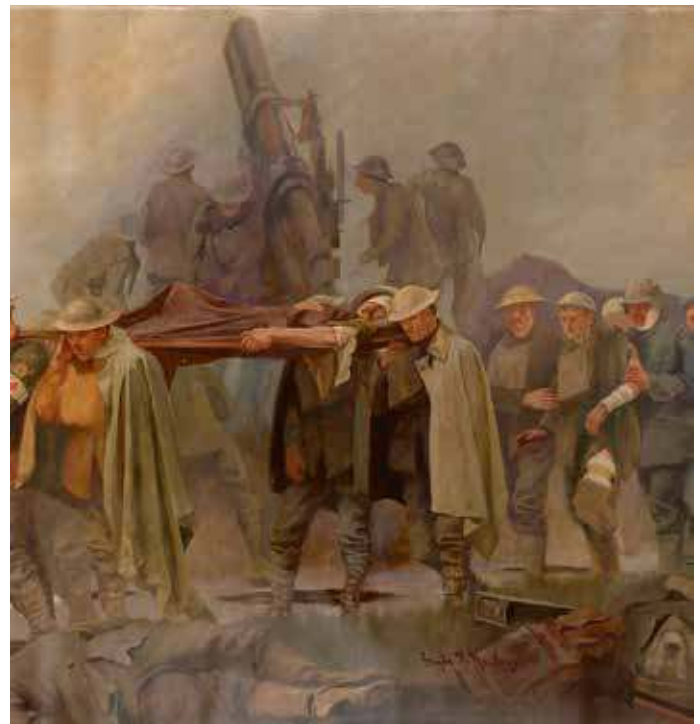
Artist's rendition of the Royal Army Medical Corps on active service in WWI.

Thirteen hundred medical men were selected from among the patriotic many who volunteered to fill our quota. They came from every portion of our country as soon as the need was made known. One and all, they realized that they were untrained as soldiers, and that they were to be placed side by side in competition with medical officers who had endured the hardships of two years of war—men who had earned promotion by long service, and who would outrank each and every one of them. Nor would they be privileged to serve with their own companions under their own flag; but one by one, individually, they would be ordered to serve with strangers, men of a different nation; and under a foreign flag....not one of these patriotic men hesitated for a moment. No one who had to do with this brilliant chapter of the volunteer army of the reserve corps in The Great War but was thrilled by the self-sacrifice of the young