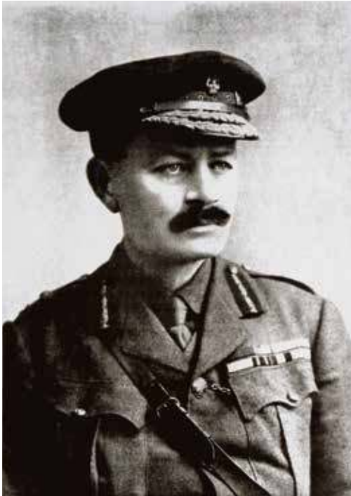
General Julian Byng.