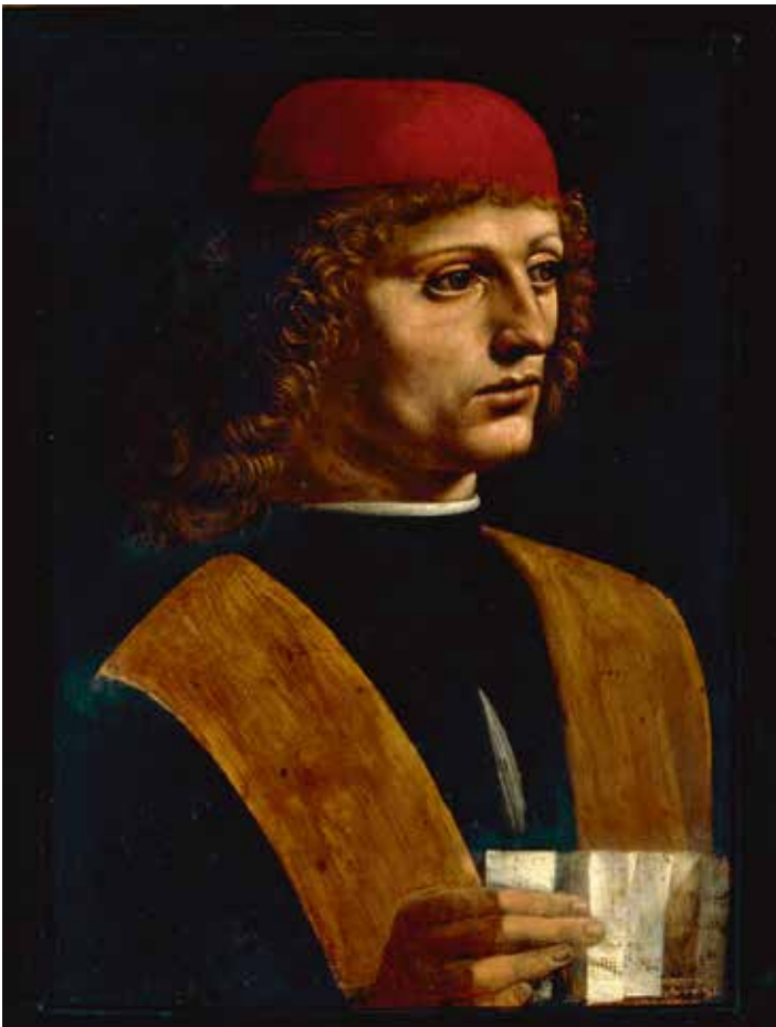
Leonardo da Vinci, Portrait of Unknown Musician . Oil on wood panel, circa 1490.

Seeing with a better eye is crucial in medicine. “The whole art of medicine,” remarked Sir William Osler, “is in observation.” 37 He added, there is “no more difficult art to acquire than the art of observation.” 38 This is becoming ever more difficult when physicians spend 12 percent of their time observing patients, and 40 percent observing computers. 18