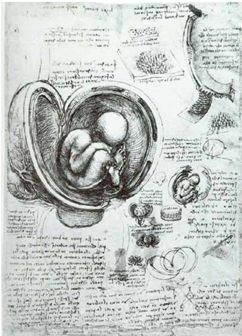
Leonardo da Vinci, The Foetus in the Womb . Pen and ink over red chalk, circa 1510-1513.

Major adversities are not uncommon in the life of geniuses, 10 yet, for Leonardo they might