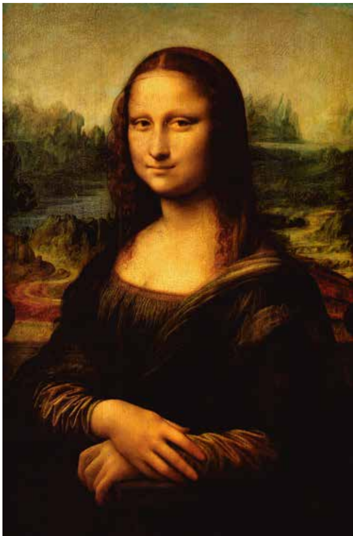
Leonardo da Vinci, Mona Lisa . Oil on poplar wood, circa 1503–1506.