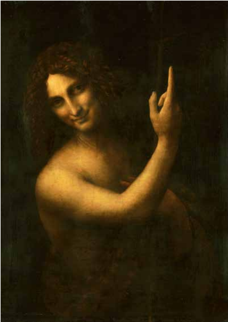
Leonardo da Vinci, St. John the Baptist . Oil on walnut wood, circa 1513–1516. Royal Collection, The Windsor Castle