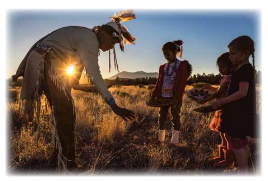
Navajo medicine man teaching his daughters.

It was dark when we crossed, we were afraid the soldiers on the Lao side would spot us. We thought we were safe