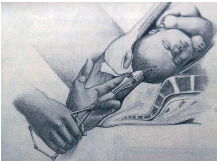
Perforation of the fetal head as illustrated in An American Text-Book of Obstetrics for Practitioners and Students . 22

Second, the Perforator reminds us of the complex ethical problems