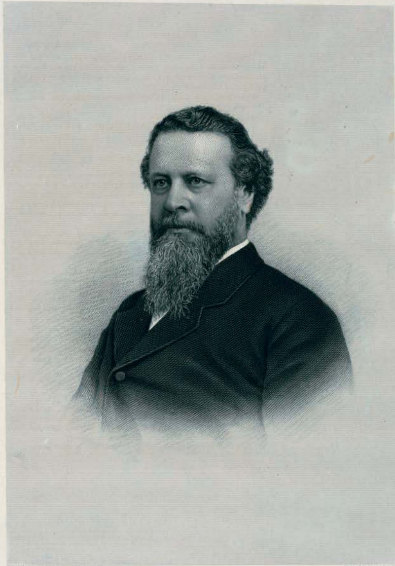
Illustration published by Knickerbocker Co. New York.