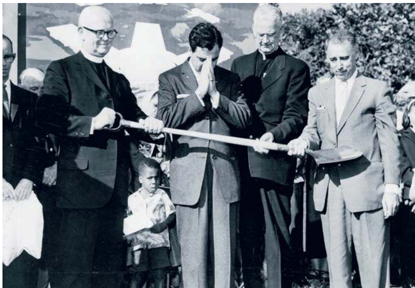
Danny Thomas and Clergy at St. Jude's Hospital groundbreaking ceremony, 1958.