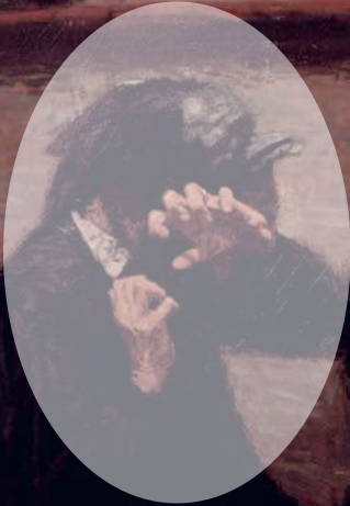
The Gross Clinic , by Thomas Eakins, 1875.