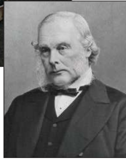
Joseph Lister, MD, 1902. PD-US-expired

paint a grand composition on the scale of The Gross Clinic . 5