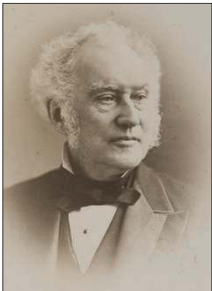
Samuel D. Gross, MD, circa 1875.