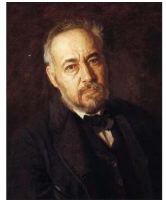
Thomas Eakins, Self-Portrait , 1902. National Academy Museum, New York