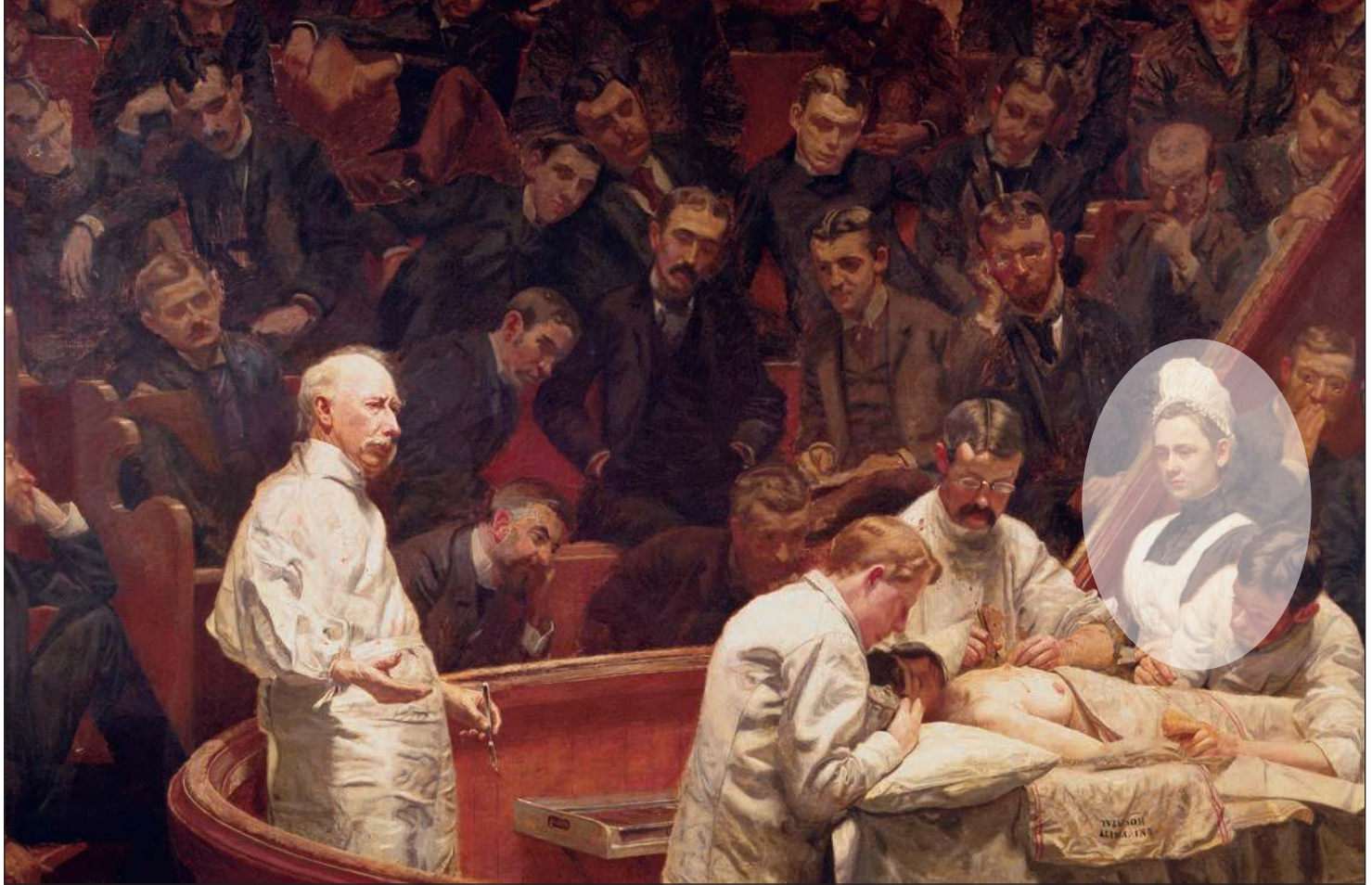
The Agnew Clinic , an 1889 oil painting by American artist Thomas Eakins.