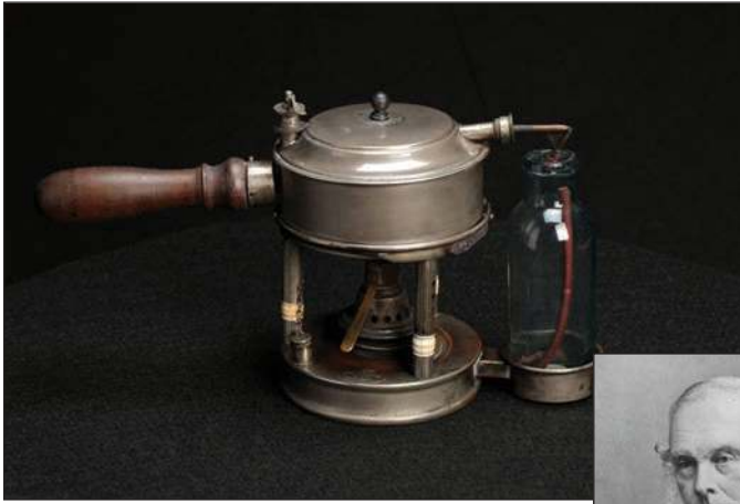
Lister carbolic acid sprayer.