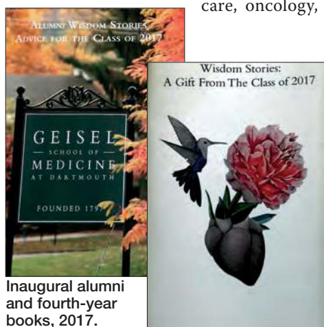
Inaugural alumni and fourth-year books, 2017.

A total of 24 stories including two poems, were written by 20 fourth-year medical students. The stories were 500-800 words in length, and the collection was bound as a soft cover book. The cover had an original illustration by one of the student contributors. As with the alumni stories, most shared poignant clinical