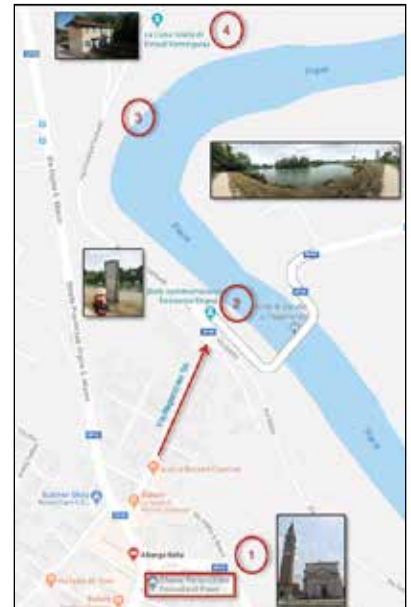
Retracing Hemingway's footsteps on the night of July 8, 1918. (modified from Google Maps)

From the Fossalta church (Stop 1), walk toward the river following Via Ragazzi del '99—a reference to the Italian kids who like Hemingway were born in 1899 and fought bravely along