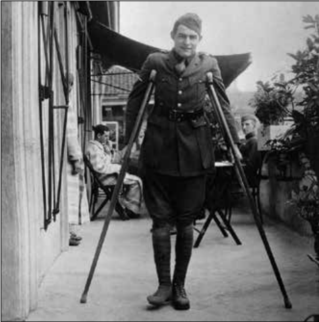
Ernest Hemingway (1899-1961) american novelist here during his convalescence in Milan, Italy (American Red Cross Hospital) in 1918.

for Italy lasted a lifetime. As he wrote to a friend in March 1919, "I'm so homesick for Italy that when I write about it, it has that something ...that you only get in a love letter." 7 Thirty years later he added, "[Italy is] like having died and gone to Heaven, a place you'd figured never to see." 15