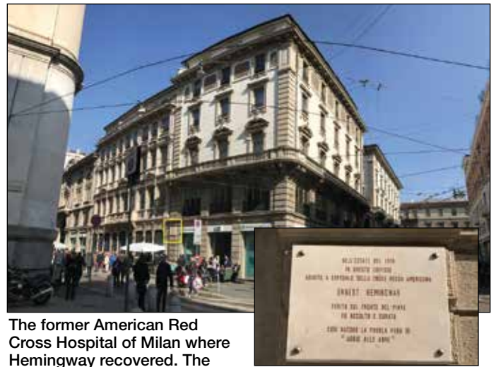
The former American Red Cross Hospital of Milan where Hemingway recovered. The plaque says, "In the summer of 1918, this building housed the American Red Cross Hospital where Ernest Hemingway, wounded on the Piave front, was welcomed and treated. And so it was born the true tale of 'A Farewell to Arms.'"

Hemingway's lengthy ordeal was unusual for this war. When Italy entered WWI in 1915 its armed forces relied on 126 dressing stations of 50 beds each; 84 small field hospital of 100 beds; and 42 larger field hospitals of 200 beds each. The Italians also had 28 base hospitals near the front, plus a fleet of 108 motorized ambulances. 12 Conversely, by