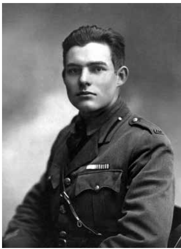
Ernest Hemingway in Milan 1918.