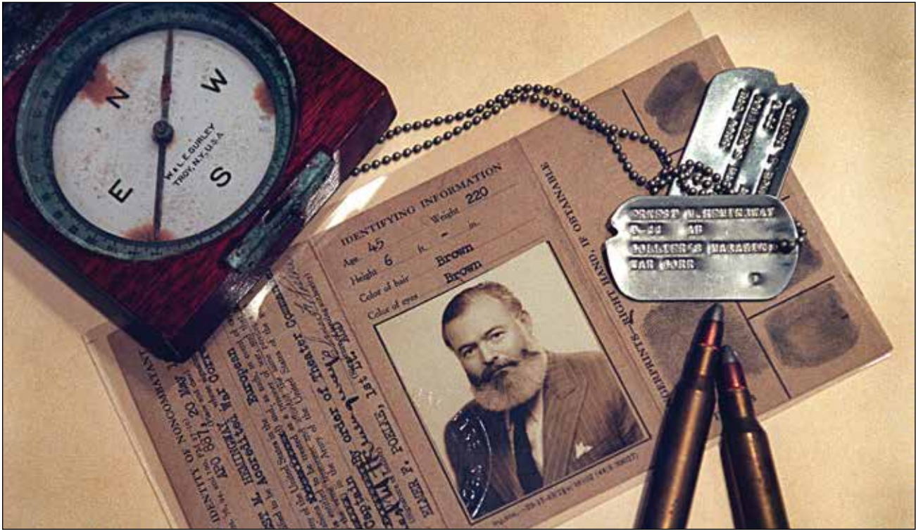
Ernest Hemingway possessions, his dogtags, WW II war correspondents credential, hunting bullets and compass. At JFK Library.