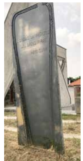
Commemorative steel plaque on the Piave embankment.