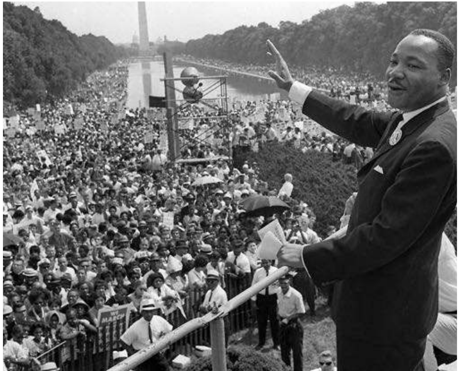
U.S. civil rights leader Martin Luther King, Jr., waves to supporters from the steps of the Lincoln Memorial August 28, 1963, on The Mall in Washington, DC, during the March on Washington where King delivered his famous “I Have a Dream” speech.