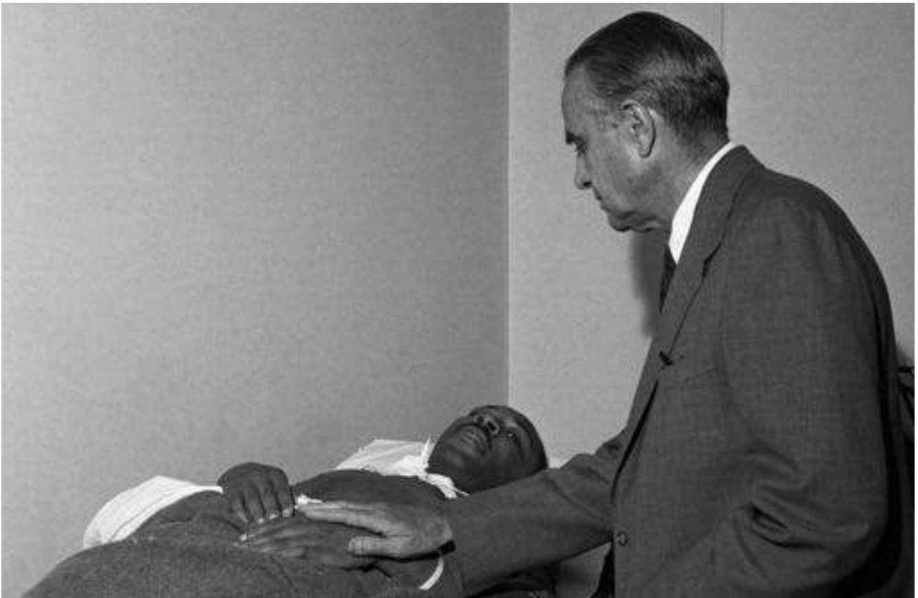
New York Governor Averell Harriman stands at the hospital bed of Dr. Martin Luther King, Jr.

Analyzing the situation while scrubbing up, I realized why no one had proceeded with surgery, which ordinarily would have been done. Preliminary measures had contributed to the stabilization of the patient's condition, so precipitate action had been withheld. In the face of the unprecedented public reaction to the assassination attempt, which brought to the hospital government officials and dignitaries from every level, as well as a concentration of the communication media,