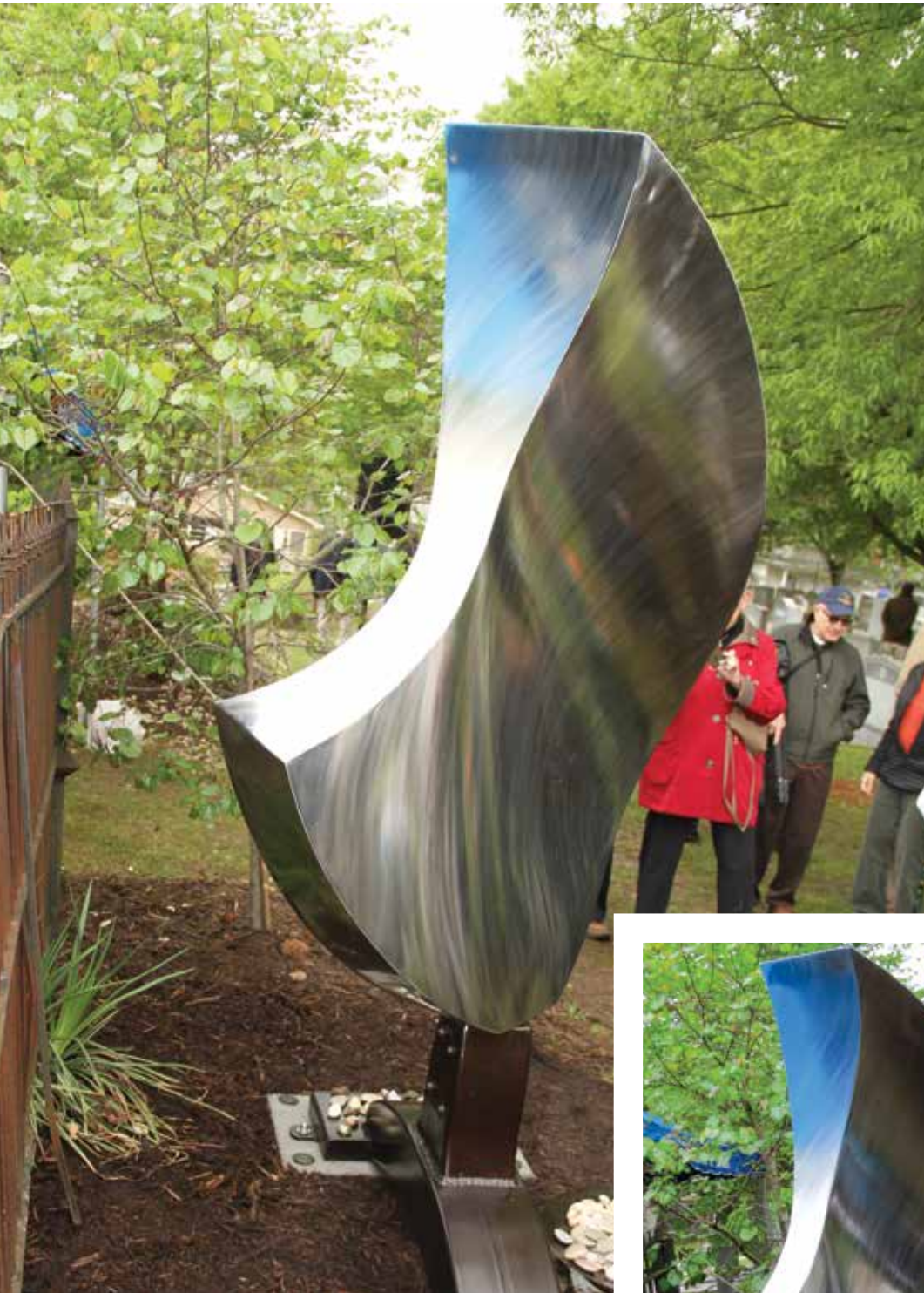
Left, the sculpture that was placed over the grave and was unveiled 11 months after the interment of the Dachau ashes in the Durham Hebrew Cemetery.