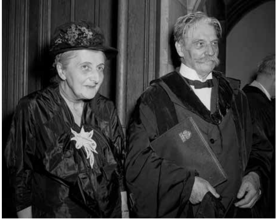
Albert Schweitzer and his wife, Helene Bresslau, in Chicago 1949.