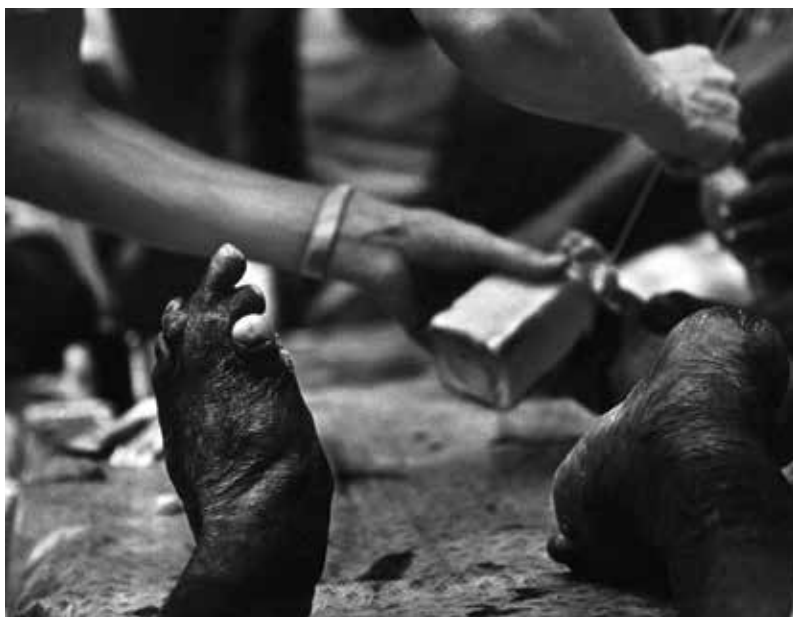
Nurse at Dr. Albert Schweitzer's hospital village treating sores on lepers' feet.