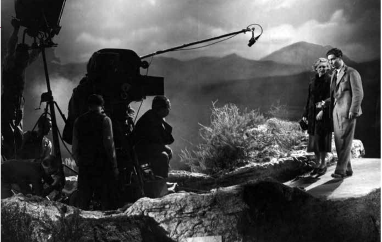
The 39 Steps (1936) starring Madeleine Carroll and Robert Donat. Center, seated under the cameras, director Alfred Hitchcock.