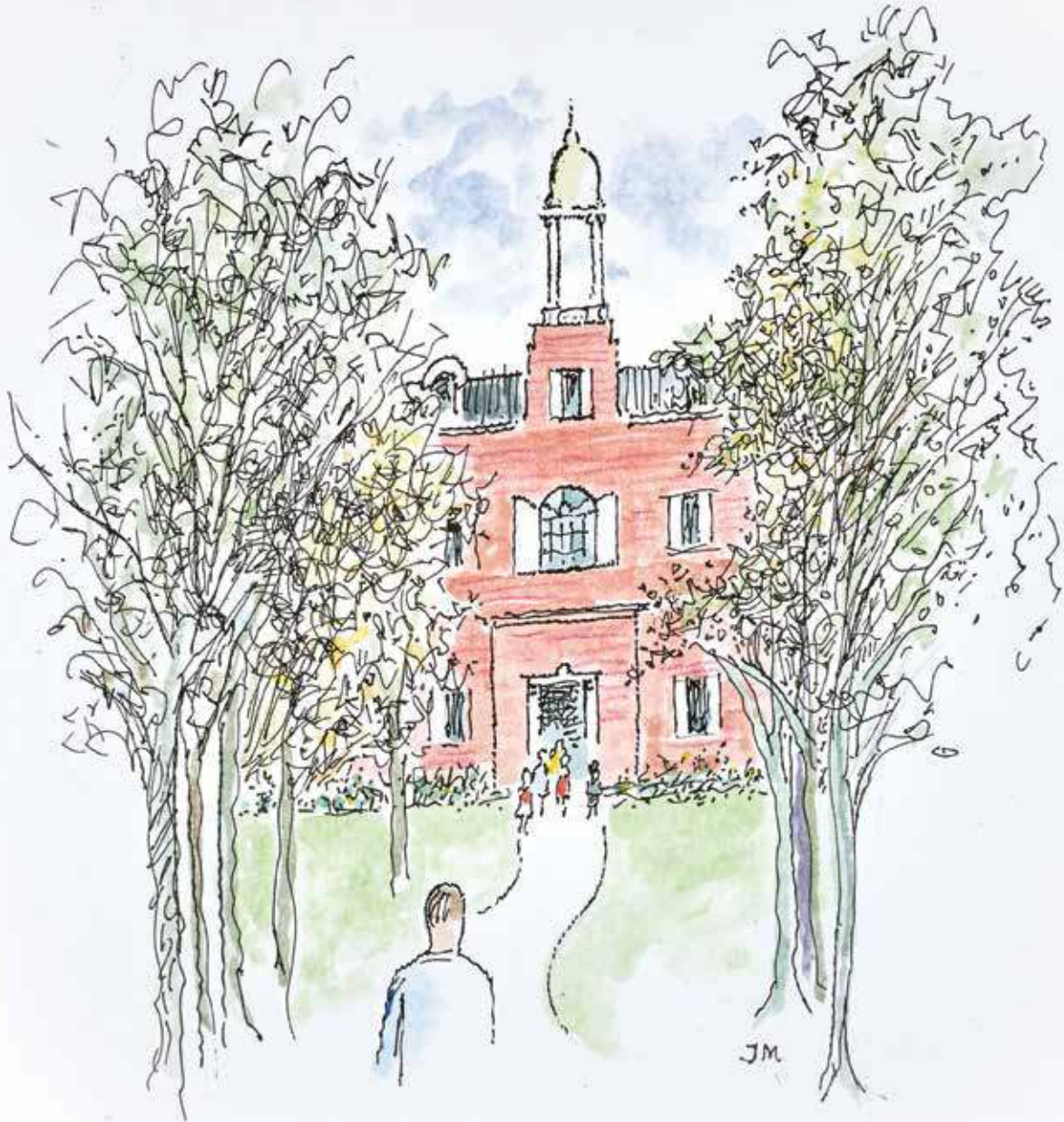
Illustrations by Jim M'Guinness