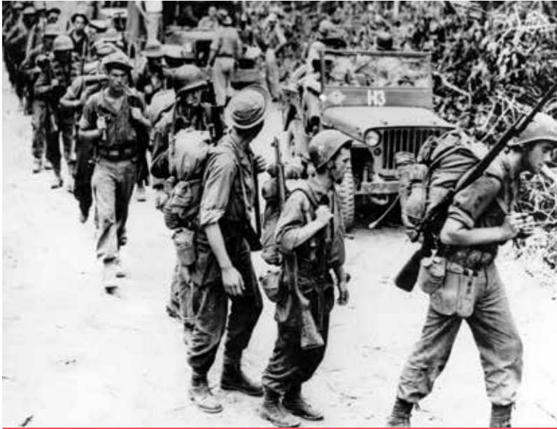
Merrill's Marauders, 1944.

the beneficiaries of military planners who prioritized high medical standards, and appreciated and supported medical research.