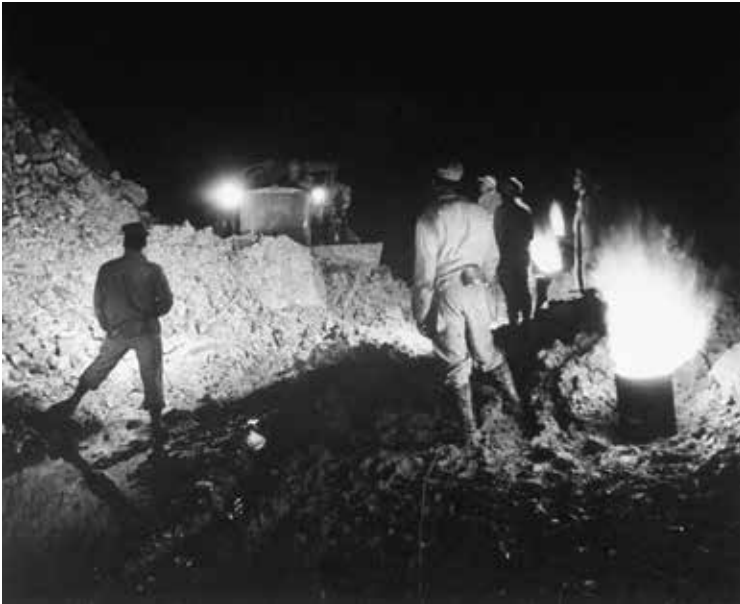
Bulldozer clearing away a landslide that covered Ledo Road, 1943.