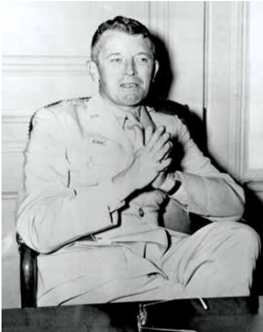
Brigadier General Frank D. Merrill speaking about Merrill's Marauders, 1944.