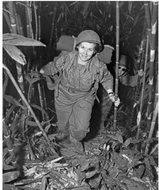
Fighting nurses of the jungle on the India-Burma border, 1943.

life, both familiar—eating, washing, and working—and unfamiliar—hunting snakes, mending mosquito nets, and battling dysentery.