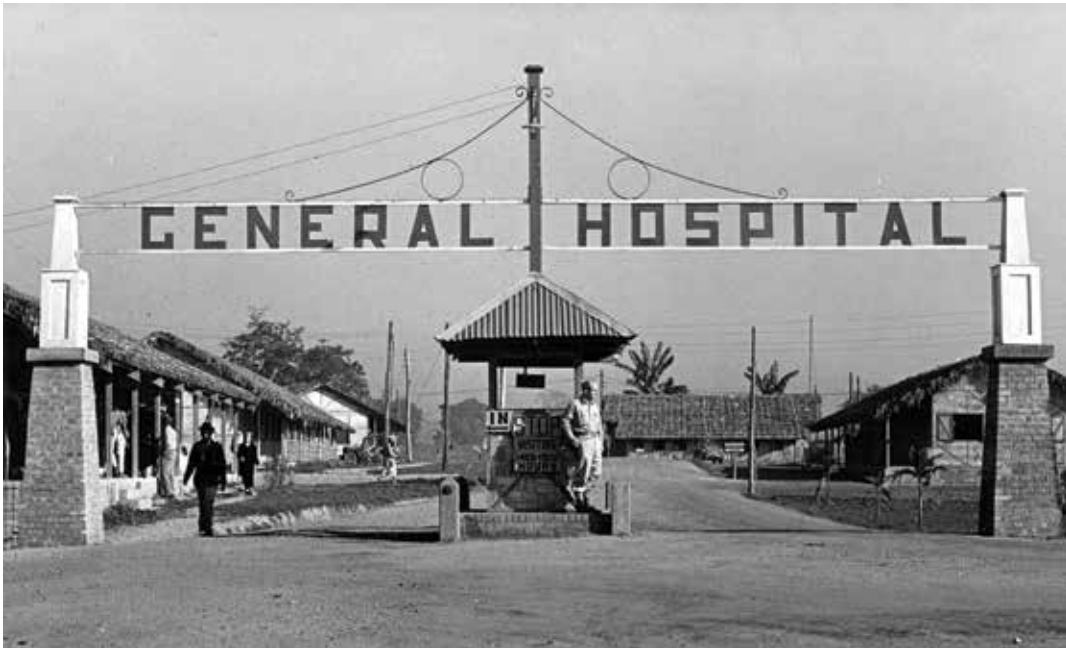
Entrance of the 20th General Hospital, circa 1944.