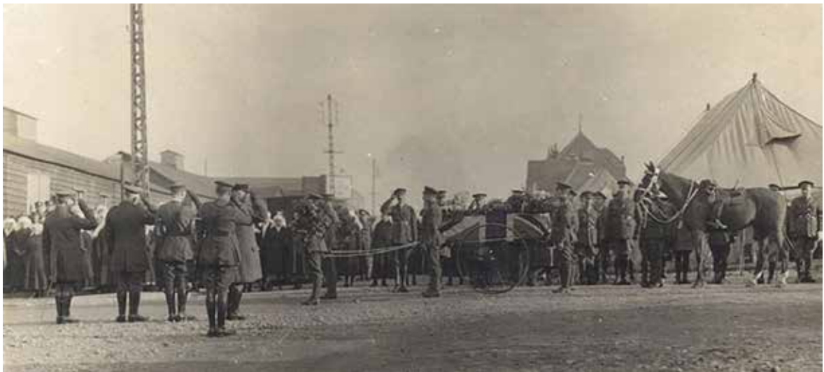
Funeral of Lt. Col. John McCrae, January 29, 1918.