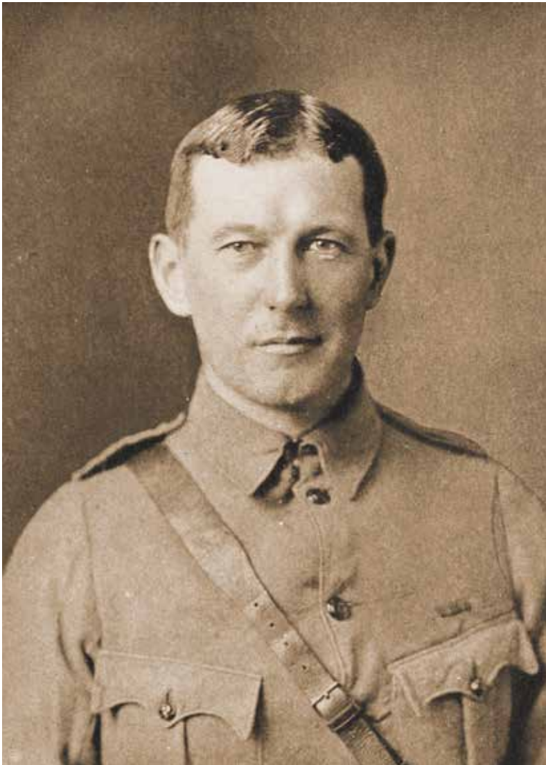
Lieutenant Colonel John McCrae, MD, Canadian Army Medical Corps.