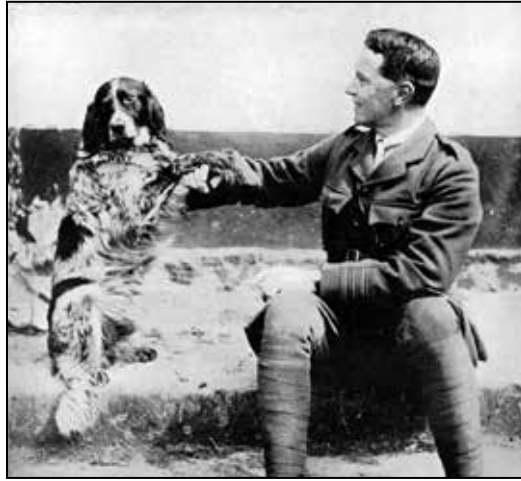
John McCrae, Canadian World War I soldier, poet, and surgeon.