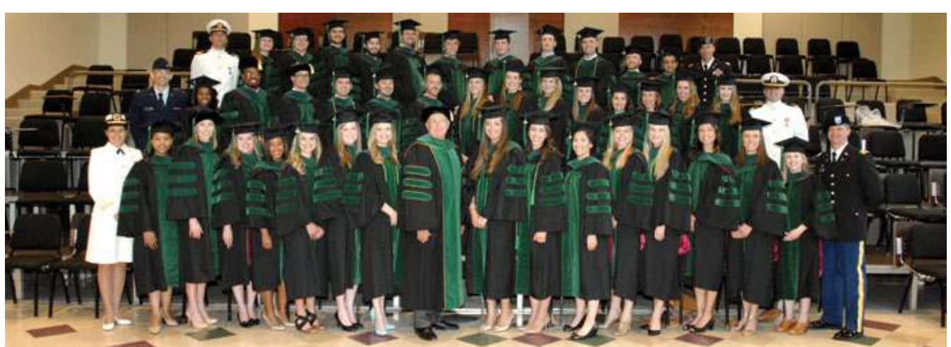
The first USC School of Medicine Greenville A \Omega A inductees, May 5, 2016.

USC School of Medicine Greenville is the ninth A\Omega A chapter chartered at a new U.S. medical school in the last four years.