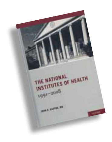
The National Institutes of Health: 1991–2008

266 Old Spanish Trail Portola Valley, California 94028 E-mail: rogoway@stanford.edu