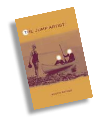
The Jump Artist

1707 Notre Dame Drive NE Albuquerque, New Mexico 87106 E-mail: dbennahum@salud.unm.edu