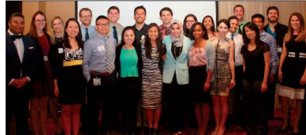
From top left, 2019 AQA Fellows in Leadership and faculty; the first graduating class of AQA members at Cooper Medical School 2017; and AQA induction banquet at UC Davis 2016.